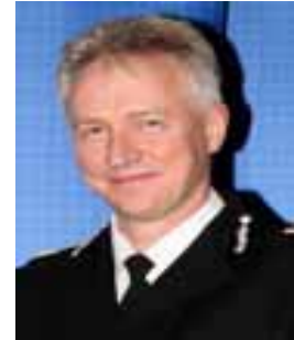
Stephen Otter Chief Constable

The subject of sexual and dangerous offenders can be complicated and understandably emotive. This annual report, our ninth, sets out what MAPPA is about locally and how it is operating in an open and approachable way. We hope that the details of key achievements and statistics will demonstrate our joint commitment, and we assure you that we will continue, in partnership, to strive to maintain the safety of all people who live, work or visit Devon, Cornwall and the Isles of Scilly.